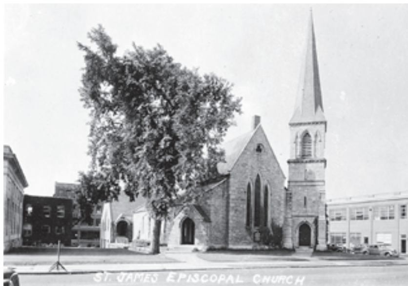
St. James Episcopal Church on West Street in Keene in the 1940s. The old post office (left) and the Keene Sentinel building (right) can also be seen.