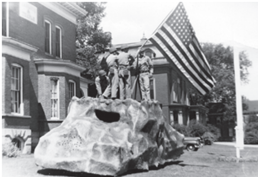
The Battle of Iwo Jima in 1945 was a major battle in which the US Marine Corps captured the island of Iwo Jima from the Japanese Imperial Army. This late 1940s/1950 float was built by the Keene Masons for a Fourth of July parade.