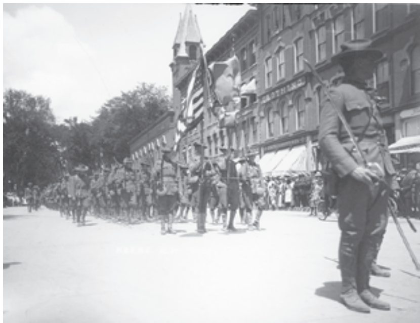
Marching from Washington Street into Central Square during a Farewell Parade was Battery G soldiers with the New Hampshire National Guard who were called up for service during the Mexican Border Conflict in 1916.