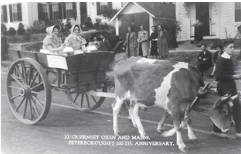
Oxen pull maids in Peterborough's 200th anniversary parade in 1939.